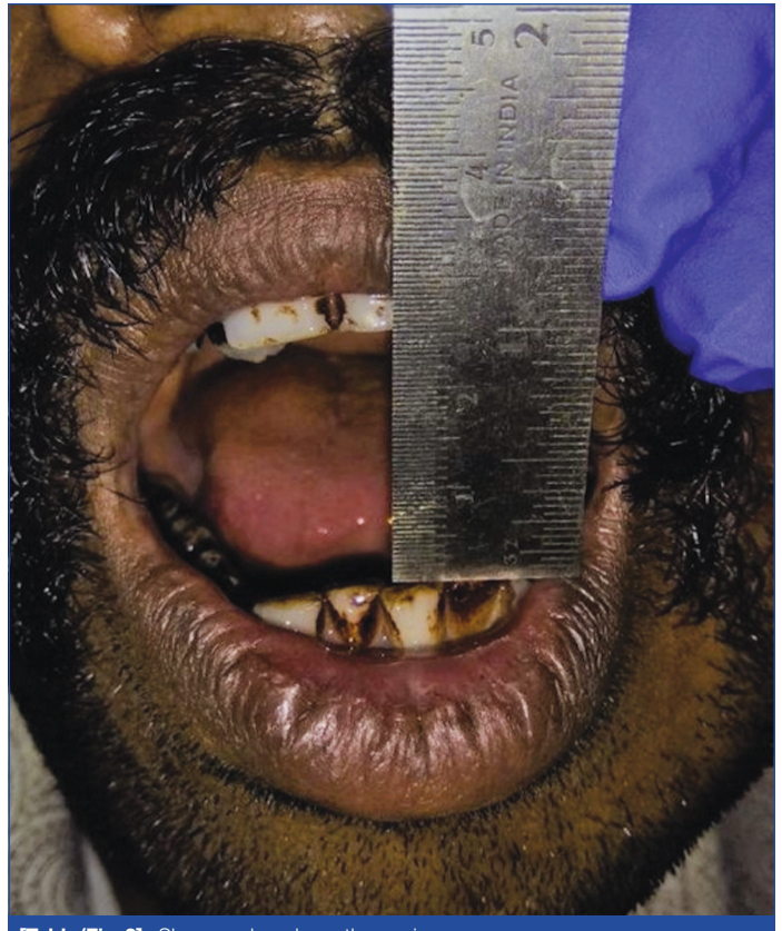
[Table/Fig-2]: Shows reduced mouth opening