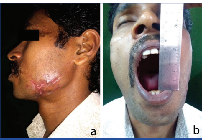
[Table/Fig-12: Showing recovery three months postoperatively a) regressed lesion b) Improved mouth opening.

[Table/Fig-11]: Shows the lesion on the 15th postoperative day.