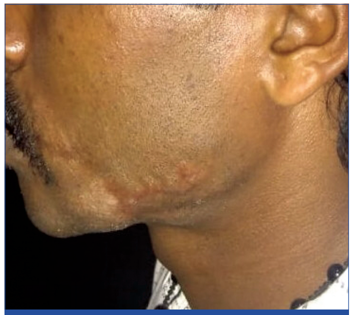
[Table/Fig-14: Shows no evidence of recurrence on follow-up after four years postoperatively.