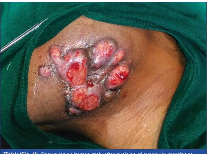
[Table/Fig-4]: Shows lesion immediately after excision of avascular margins to induce fresh bleed.

consulted was also obtained and re-examined histopathologically that evidenced the presence of botryomycosis.