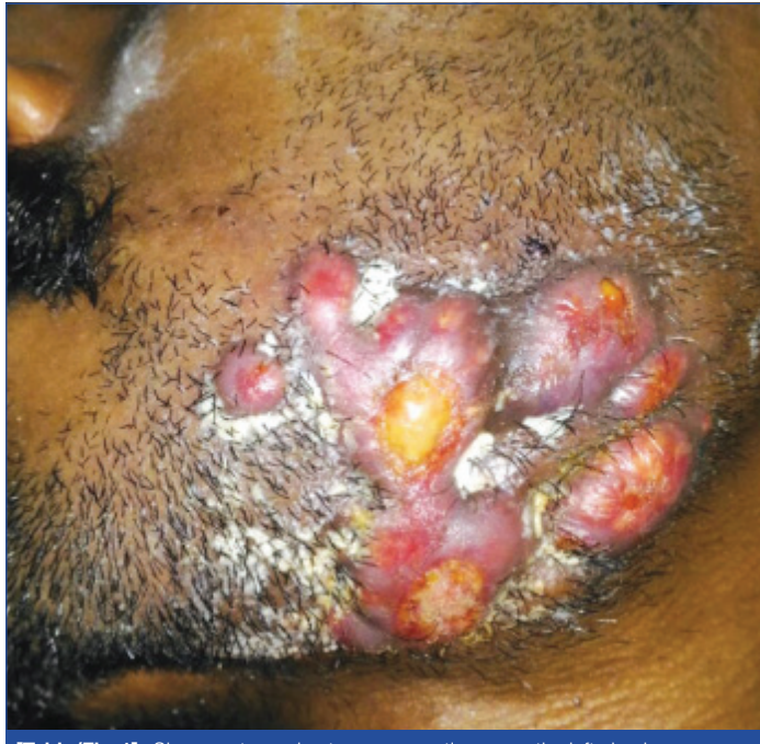
[Table/Fig-1]: Shows extra oral cutaneous eruptions over the left cheek.

crusting [Table/Fig-1]. Paraesthesia could not be elicited. Intra oral examination revealed an ill-defined swelling extending from the distal aspect of 35 to the distal aspect of 38, with obliteration of the buccal vestibule, multiple sinus tracts, and purulent material was noticed along with a reduced mouth opening of about two finger breadths [Table/Fig-2].